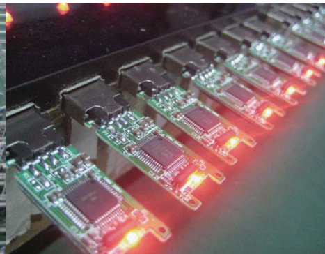
Testing semi-finished products