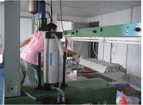
PVC making machine